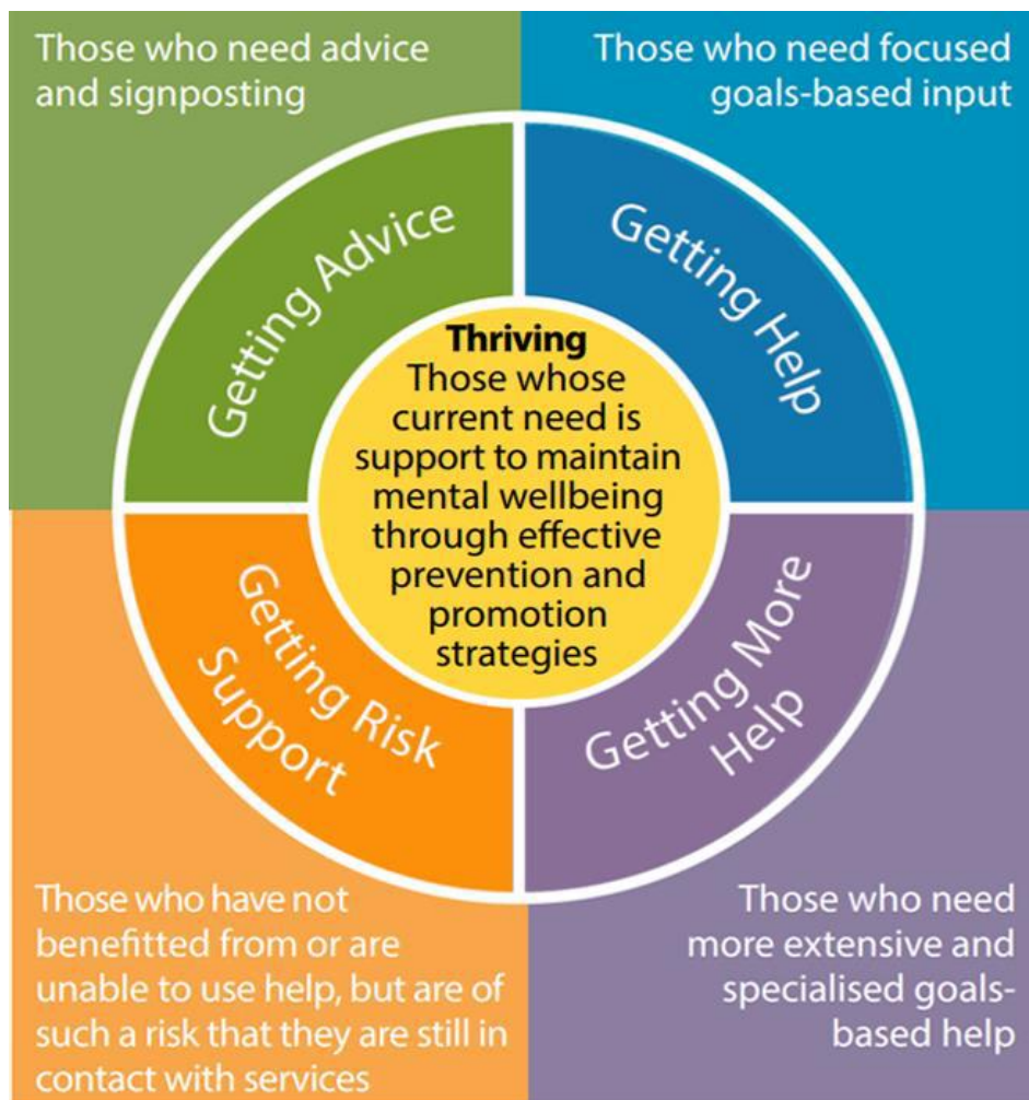
Figure 1: Thrive framework for system change, 2019